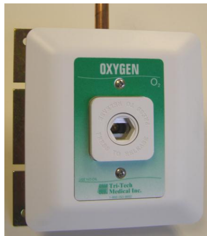
Part Number XP1124 Shown

The outlet nameplate shall be permanently color coded with a durable, scratch resistant and protective label. The outlet trim plate shall be durable plastic, attached with the nameplate to the rough-in assembly, and provide automatic plaster adjustment from 1/2 to 1 1/4