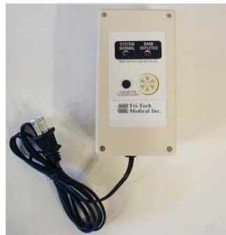
Model TAV-1 Shown above