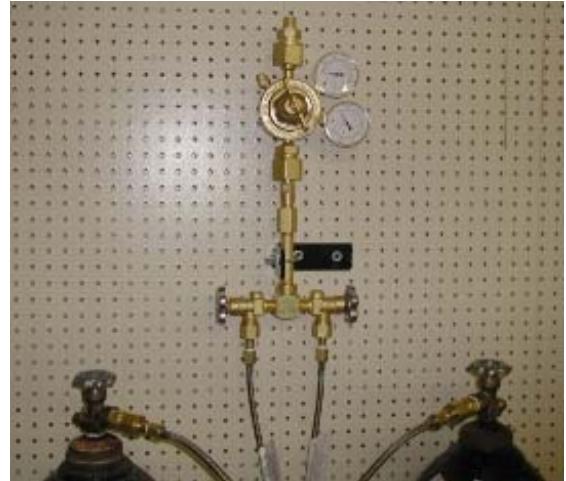
Model TSD-540 shown above

Ideal for dental or veterinary applications where manual switching of cylinders and a possible interruption of gas service are allowable. Systems are available for nitrous oxide, carbon dioxide, nitrogen, medical air and oxygen.