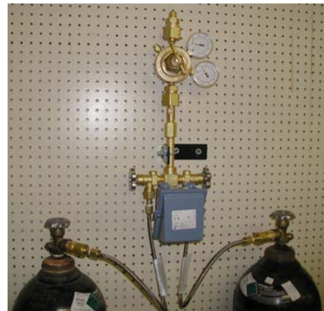
Model TSDWP-540 shown above